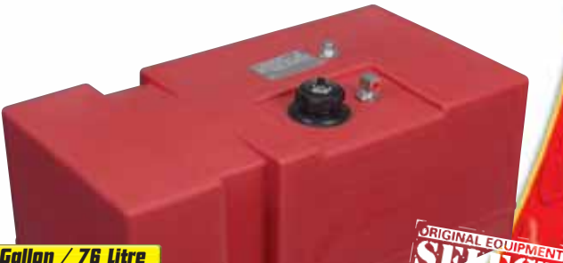
20 Gallon / 76 Litre 031620 28.00"L x 15.00"W x 12.37"H 07102 711mmL x 381mmW x 314mmH