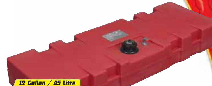
12 Gallon / 45 Litre 031612 43.00"L x 15.00"W x 6.00"H 07099 1092mmL x 381mmW x 149mmH