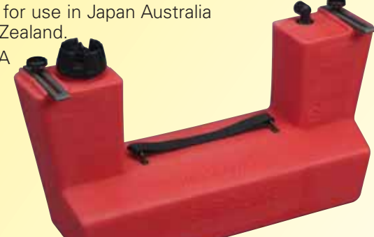
3 Gallon / 11.4 Litre 004156 23.00"L x 6.50"W x 12.75"H 04156 584mmL x 165mmW x 323mmH