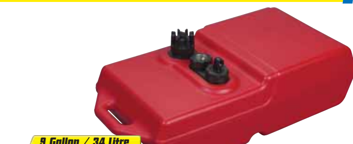
9 Gallon / 34 Litre 031109 29.50"L x 13.75"W x 10.00"H 07096 749mmL x 349mmW x 254mmH