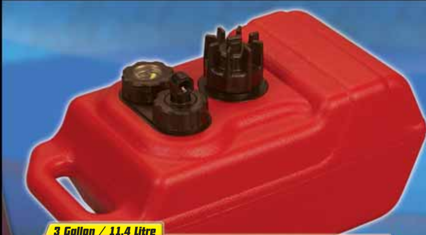
3 Gallon / 11.4 Litre 031103 18.13"L x 8.87"W x 9.87"H 07094 460mmL x 225mmW x 250mmH