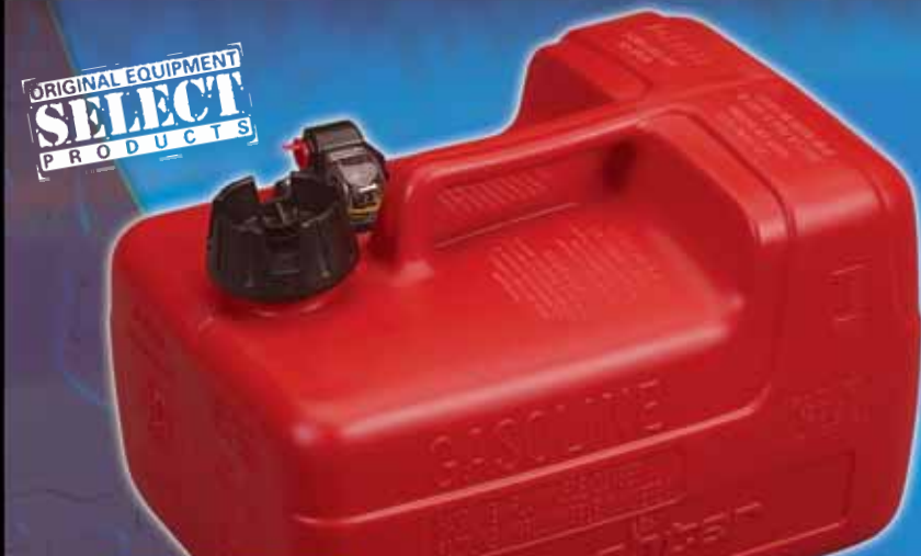
3.2 Gallon / 12 Litre 003780 14.25"L x 10.25"W x 9.00"H 03780 362mmL x 260mmW x 228mmH