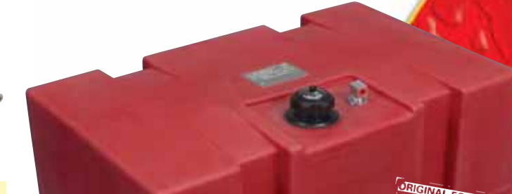
26 Gallon / 98 Litre 031526 29.25"L x 19.00"W x 12.25"H 07103 743mmL x 482mmW x 311mmH