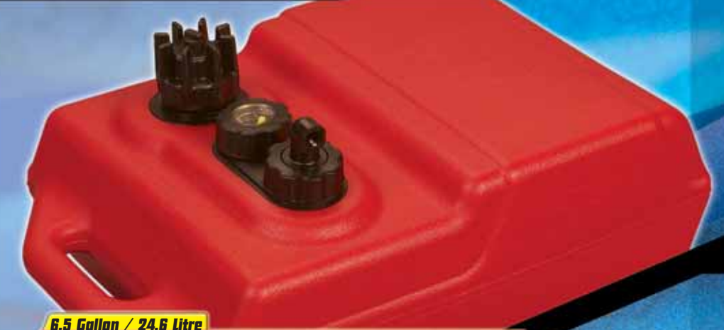
6.5 Gallon / 24.6 Litre 031106 21.50"L x 13.75"W x 10.00"H 07095 546mmL x 349mmW x 254mmH