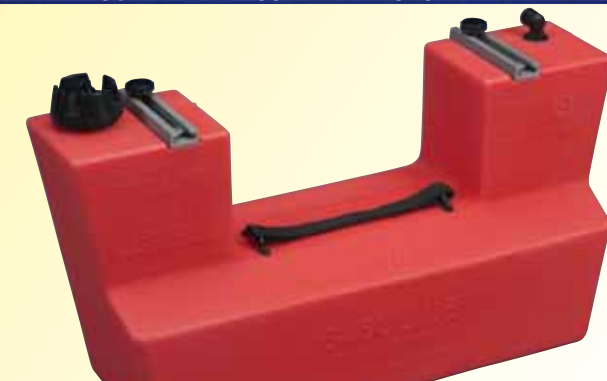
6 Gallon / 22.7 Litre 004157 26.00"L x 8.00"W x 14.75"H 04157 660mmL x 203mmW x 374mmH