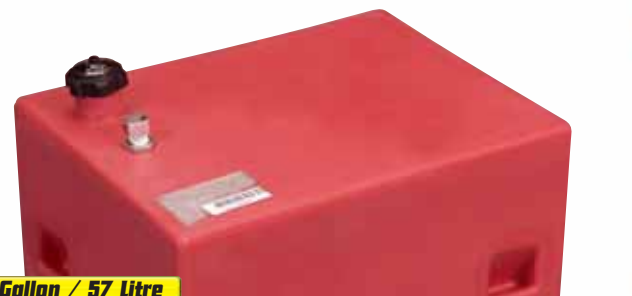
15 Gallon / 57 Litre 031615 21.00"L x 16.00"W x 12.00"H 07104 533mmL x 406mmW x 304mmH