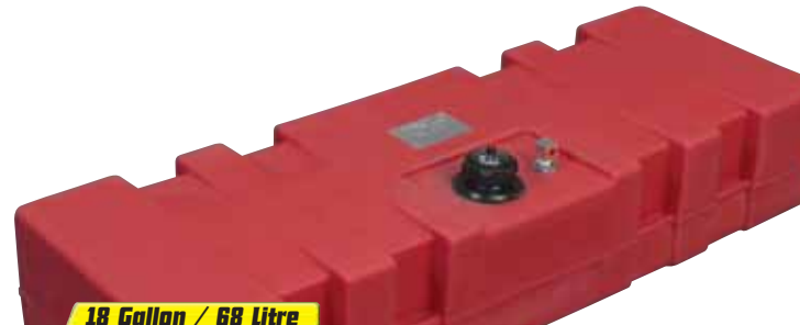
18 Gallon / 68 Litre 031818 43.00"L x 15.00"W x 7.87"H 07101 1092mmL x 381mmW x 200mmH