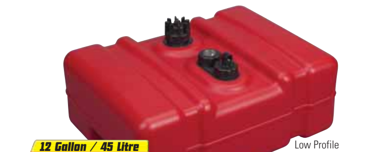
12 Gallon / 45 Litre 031212 24.00"L x 18.00"W x 11.50"H 07098 609mmL x 457mmW x 292mmH