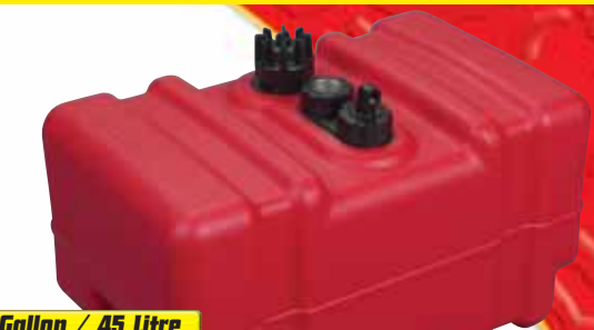
12 Gallon / 45 Litre 031112 23.00"L x 14.00"W x 14.50"H 07097 584mmL x 355mmW x 368mmH