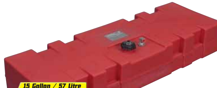
15 Gallon / 57 Litre 031615 43.00"L x 15.00"W x 6.87"H 07100 1092mmL x 381mmW x 174mmH