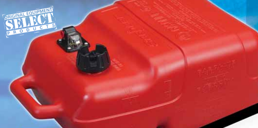
6.6 Gallon / 25 Litre 003781 21.25"L x 14.00"W x 9.75"H 03781 546mmL x 355mmW x 225mmH