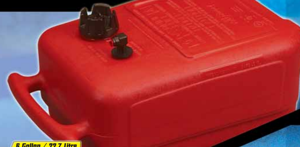
6 Gallon / 22.7 Litre 004921 20.50"L x 12.75"W x 10.50"H 04921 520mmL x 330mmW x 254mmH