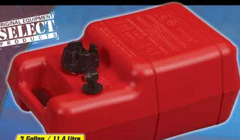
3 Gallon / 11.4 Litre 004158 16.75"L x 10.75"W x 8.00"H 04158 431mmL x 266mmW x 203mmH